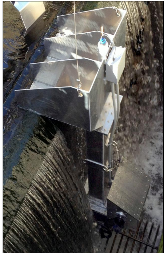
The prototype being installed at WSUD in Port Orchard, WA

If the flow rate of the site exceeds the maximum flow rate of the turbine, then the possibility exists to analyze the frequency distribution of the site for the feasibility of a 2 nd turbine to capture the extra power available. For example, if the site averages 5 MGD, then two 2.5 MGD turbines could possibly be used to capture the full flow rate.